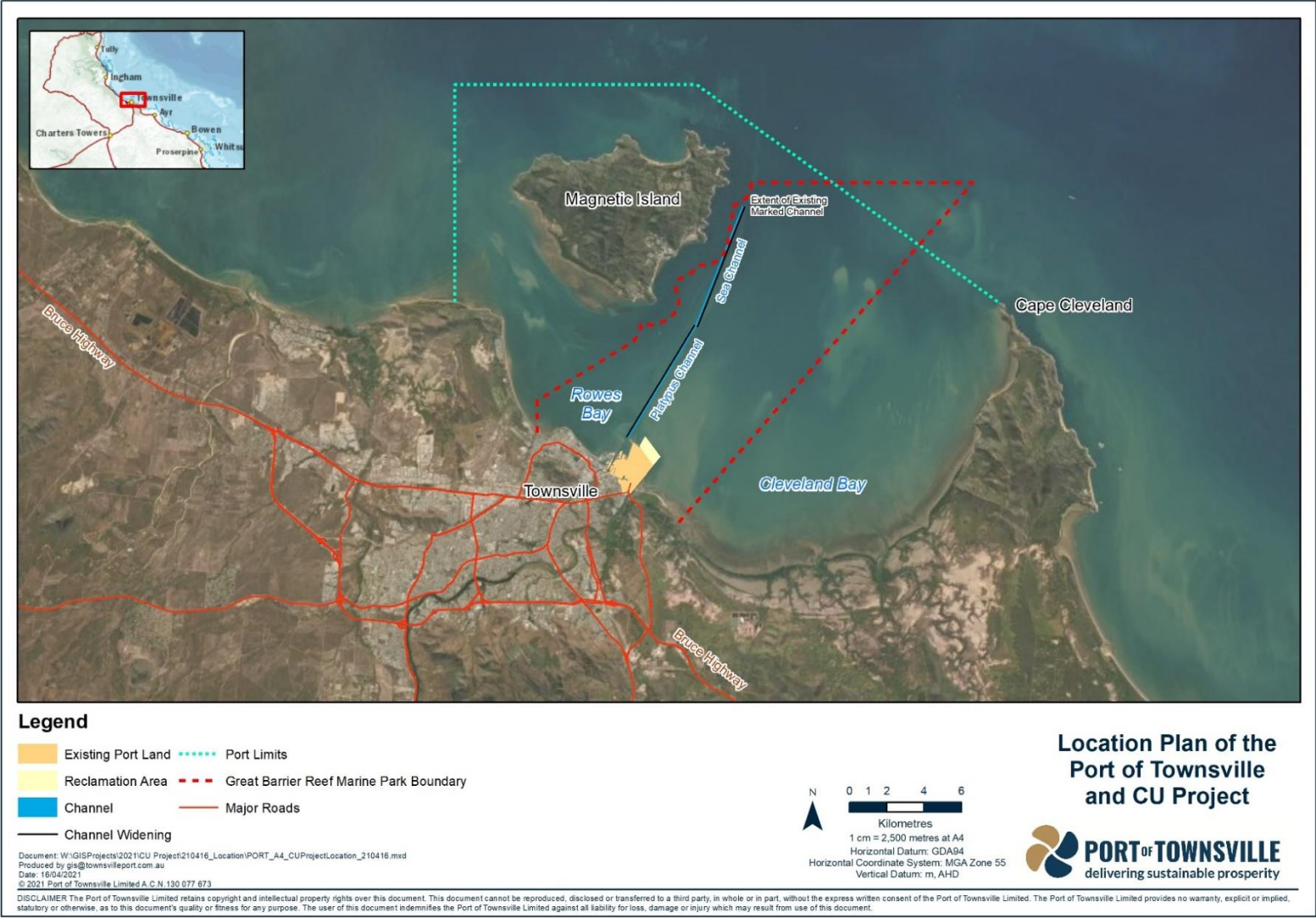
Figure 1: Locality Plan of the Port of Townsville & CU Project