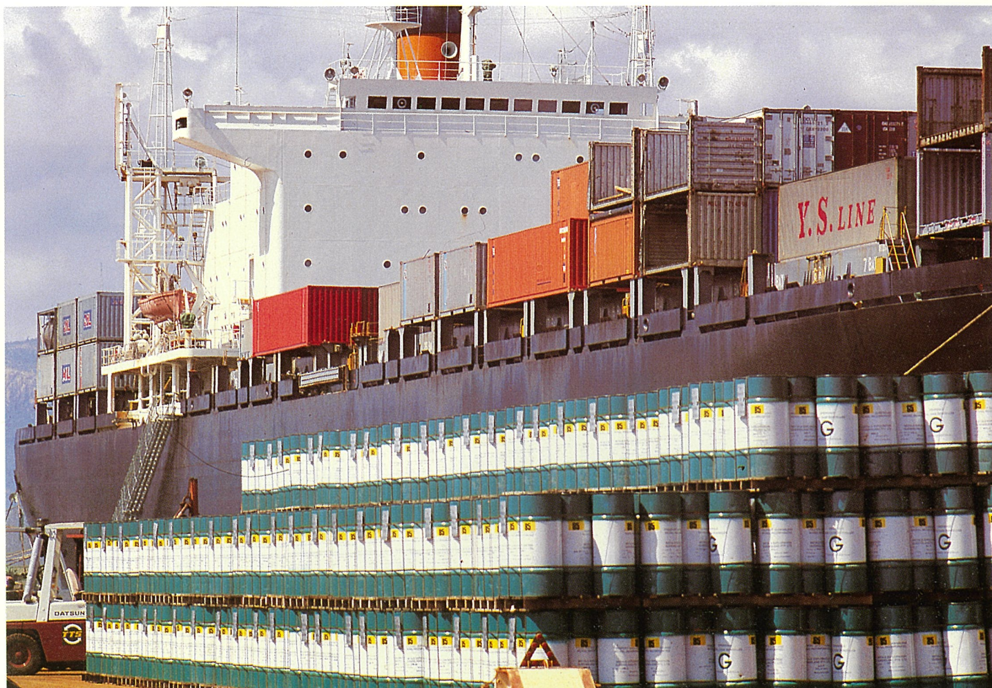
Refined nickel pellets from Yabulu await loading by the 'Jovian Laurel' for shipment to Europe.