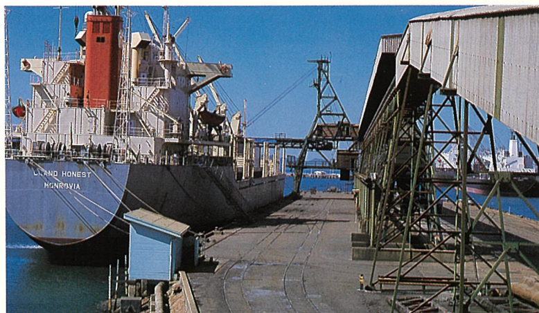
The 'Grand Honest' loads 30,501 tonnes of zinc concentrates, destination Japanese ports.