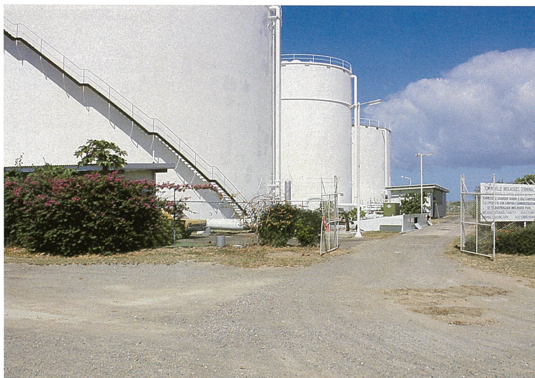
Three huge molasses tanks located behind No. 4 berth provide the storage capacity for 30,000 tonnes ready for export.