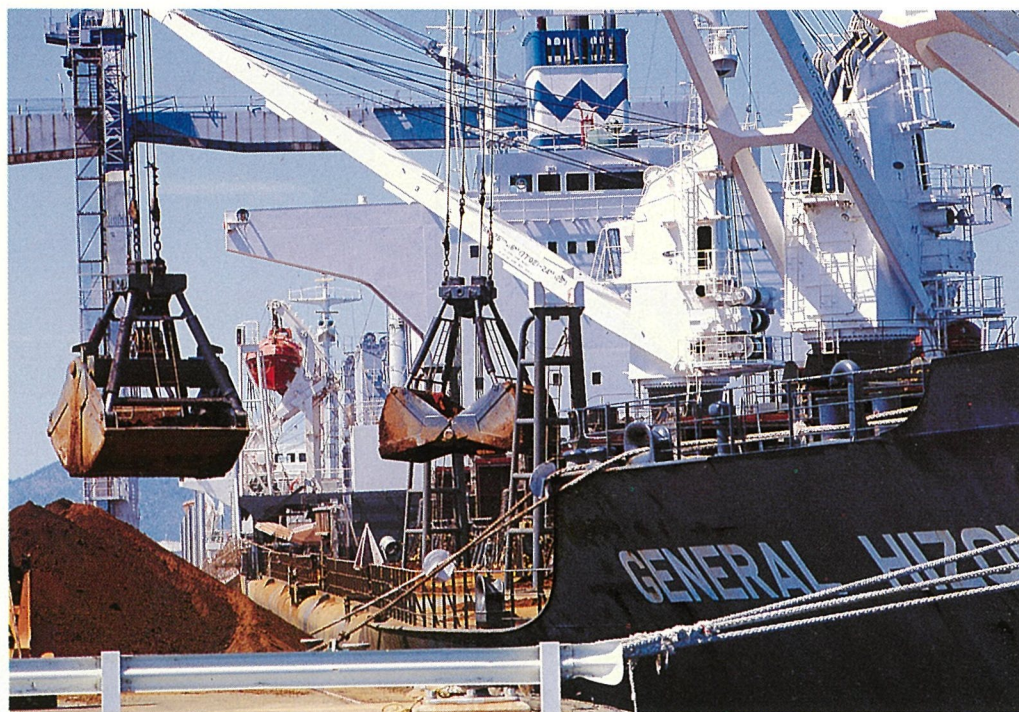
Nickel Ore is a new import to Townsville. Here the 'General Hizon' discharges 41,082 tonnes from Moneo, New Caledonia, for processing at Yabulu.