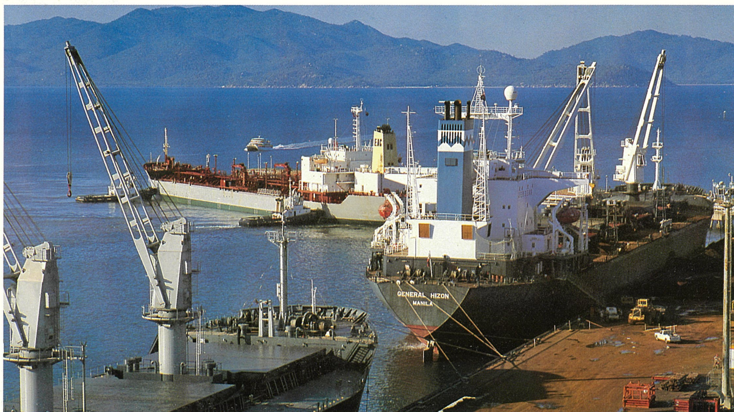
Ships bringing cargoes and others taking North Queensland products to the world are handled by an efficient tug service at the Port.