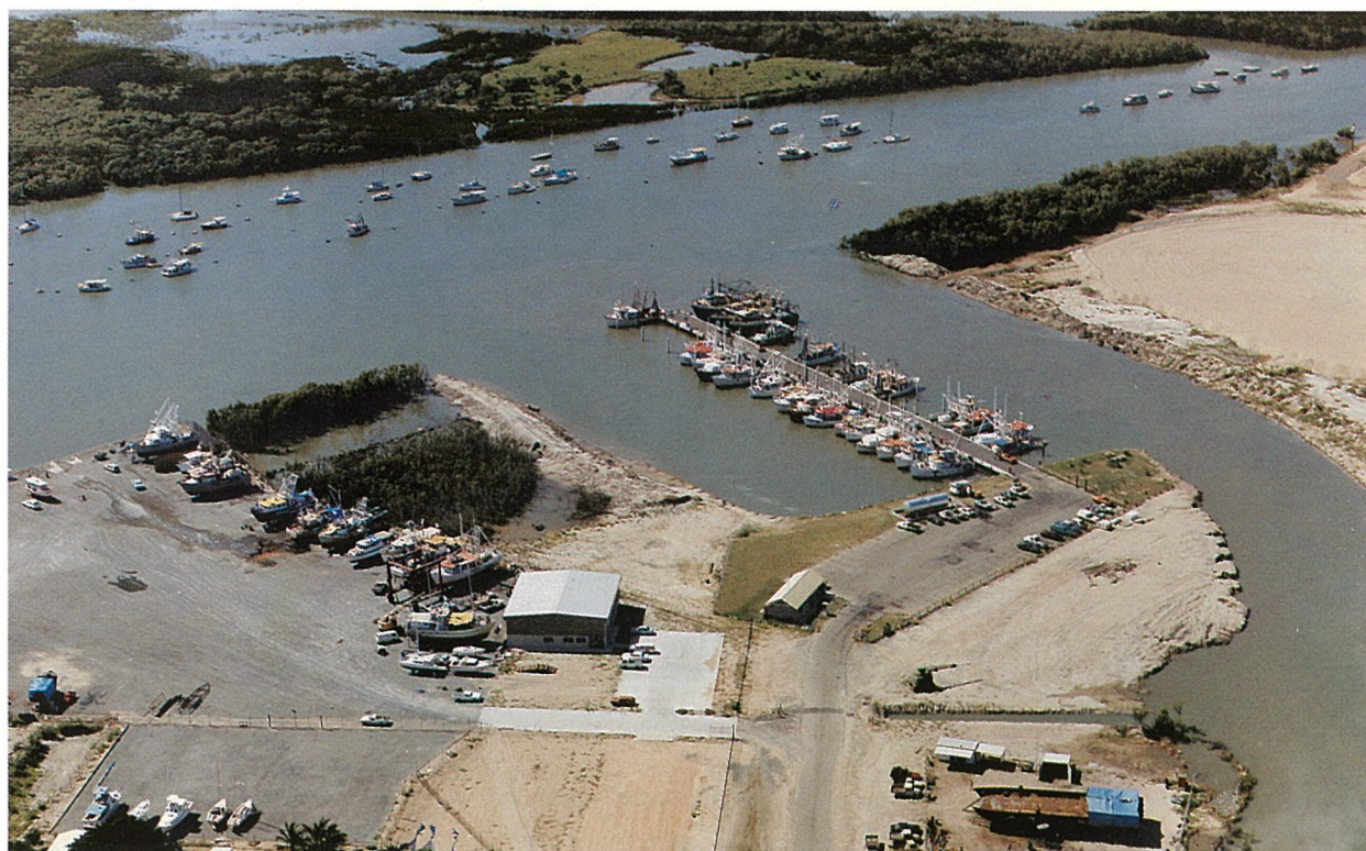
The Ross River Boat Harbour showing Fisherman's Marina with moorings for fishing boats and pleasure craft. The complex also provides for repairs and service to small craft with vessels on hardstand adjacent to engineering workshop.

The Ross River Boat Harbour provides moorings for approximately 80 fishing boats and 65 pleasure craft.