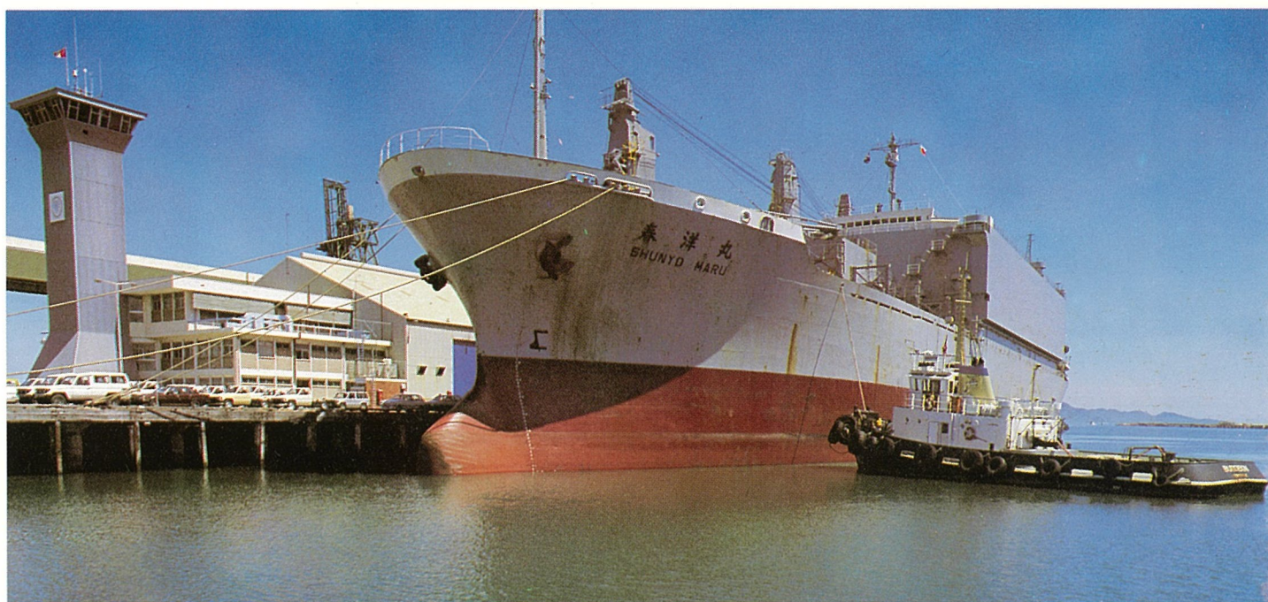
Car ships are regular visitors to Townsville to discharge motor vehicles for distribution through North Queensland. Here the 'Shunyo Maru' discharges cars from Japanese Ports.