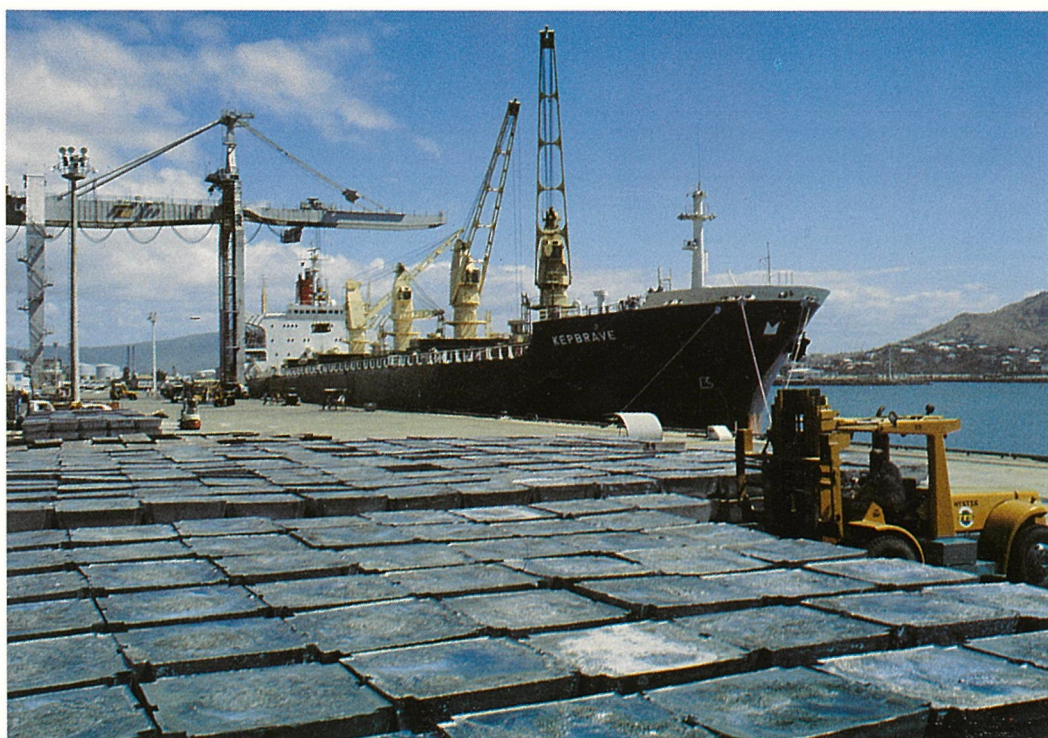
Lead from Mount Isa is one of the major exports through Townsville.