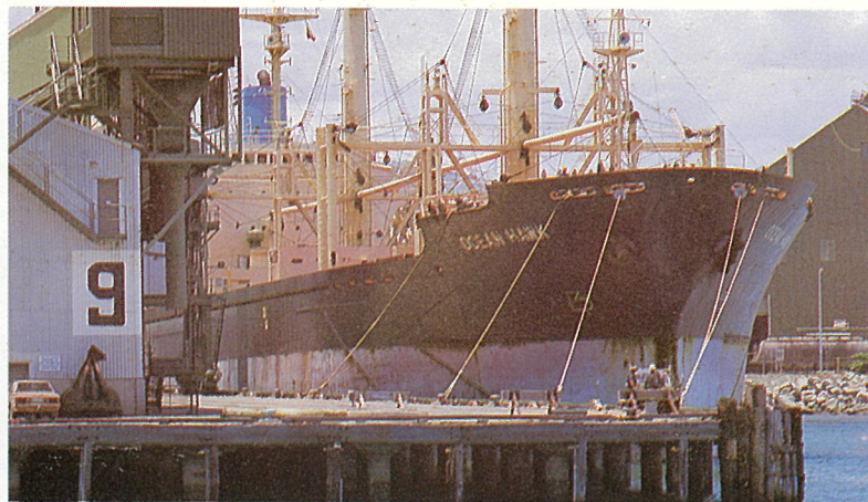
580 445 tonnes of raw sugar were exported in 1985-86. Here the 'Ocean Hawk' begins to load 15 000 tonnes for shipment to Japan.