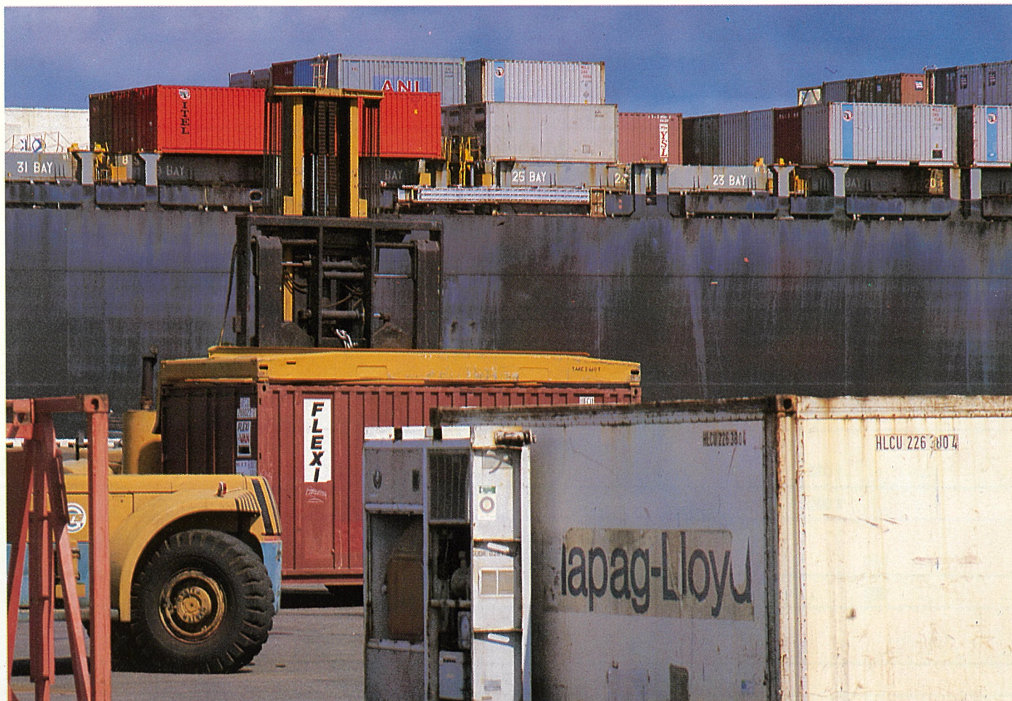
Over 26 000 tonnes of cargo passed through the Port in containers in 1985-86.