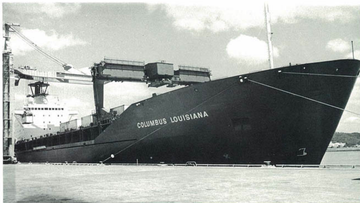
The COLUMBUS LOUISIANA loads refrigerated containers of meat at Townsville for Philadelphia U.S.A. on its inaugural voyage to re-establish regular Columbus Line shipments to the East Coast of U.S.A.

Administration Office — 1 The Strand, Townsville Q4810 Telephone (077) 72 1011 — Cables "Nausport" Telex: NAPORT 47334