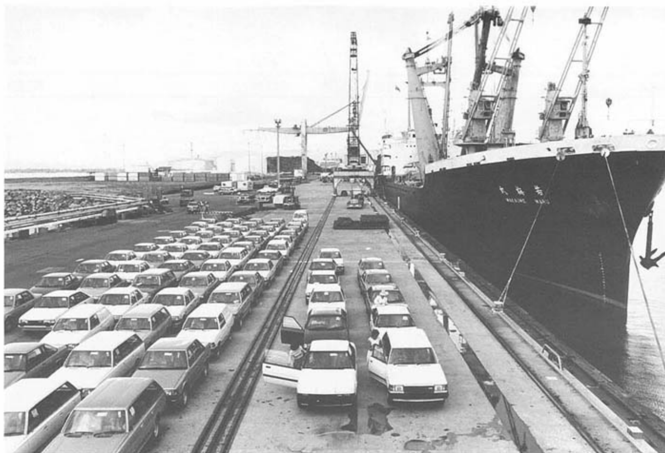
A total of 9,953 motor vehicles were imported through Townsville in 1982-83 for distribution to North Queensland centres.