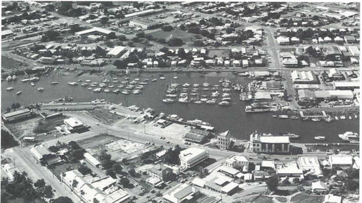
The Ross Creek Boat Harbour is now dedicated to pleasure craft, charter vessels and ferries. Safe moorings are now provided in Ross Creek for 260 vessels without hindrance to ferries and the larger charter craft. Further development on the Flinders Street side of Ross Creek provides for new wharfage for the Reef-Link Tourist operation and a site for Townsville's Bicentennial project, the Barrier Reef Marine Park Aquarium complex.

The Ross River Boat Harbour provides moorings for approximately 80 fishing boats and 33 pleasure craft.