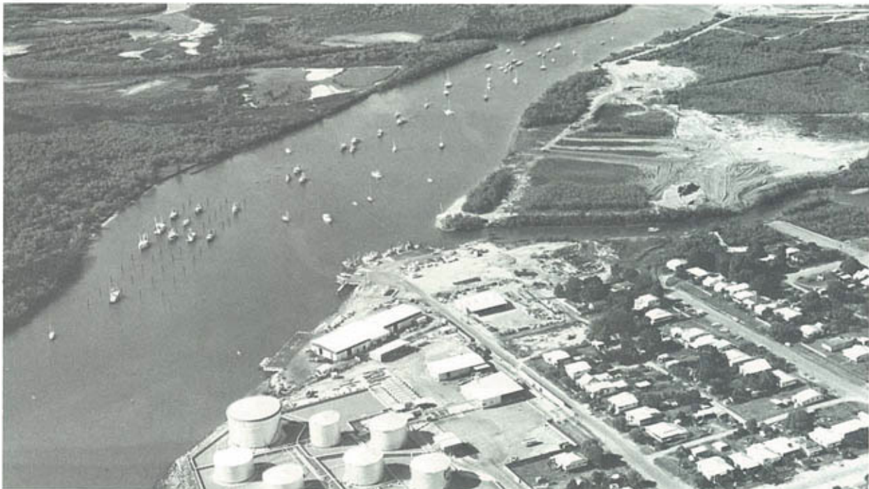
New Harbour Board workshops have been completed at Ross River. Ross River is now the headquarters of the Townsville fishing fleet and this boat harbour provides mooring for 80 fishing boats and 33 pleasure craft. A marina to accommodate 42 fishing vessels will also be provided in this area.

A new road was constructed on the eastern side of the new reclamation at the Eastern Breakwater at a cost of $165 127.