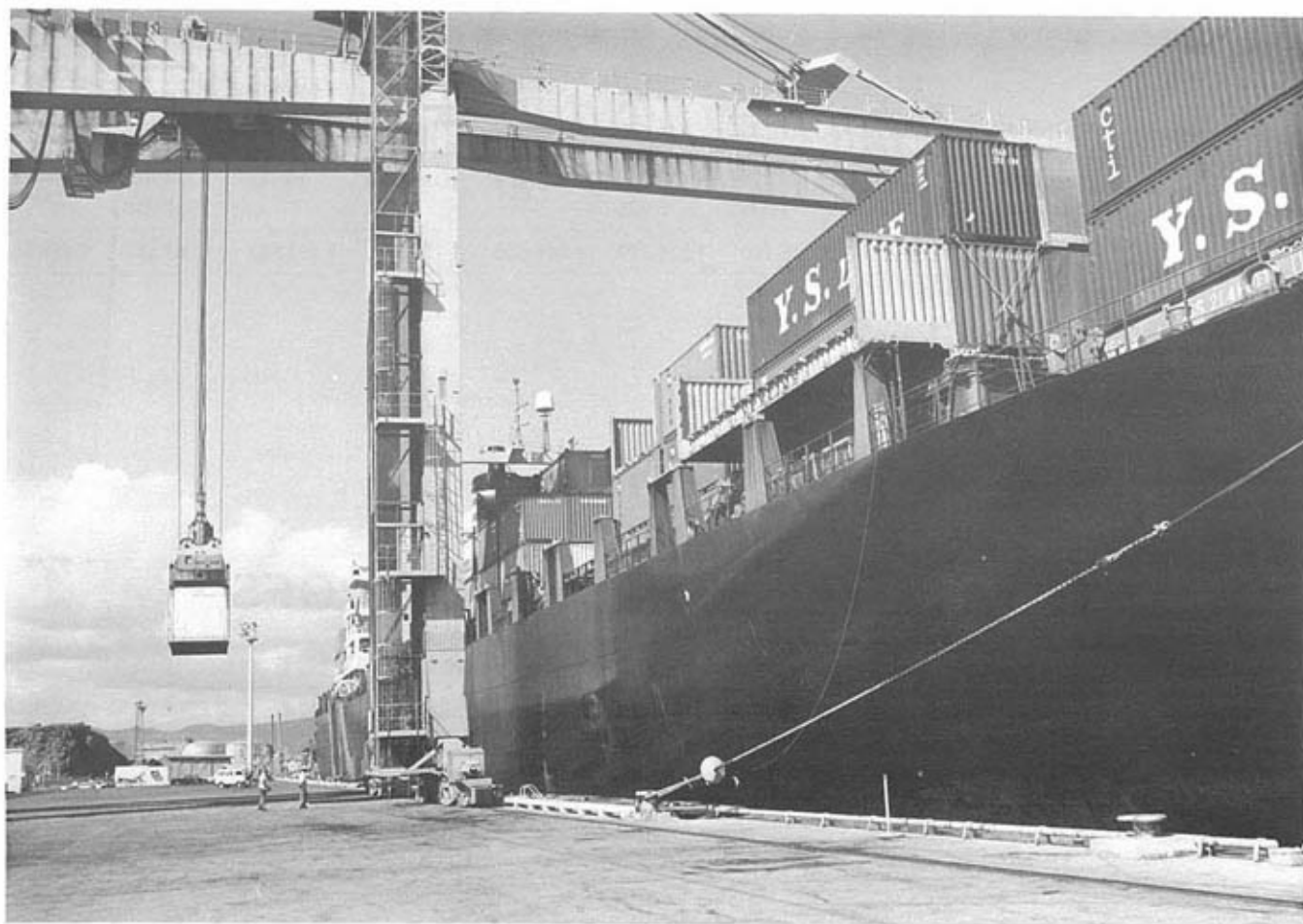
Container traffic through the Port has increased by 25% since 1980. Regular shipments handle meat and general cargo in containers to Japan, South Korea, U.S.A. West Coast, Middle East and European Ports.