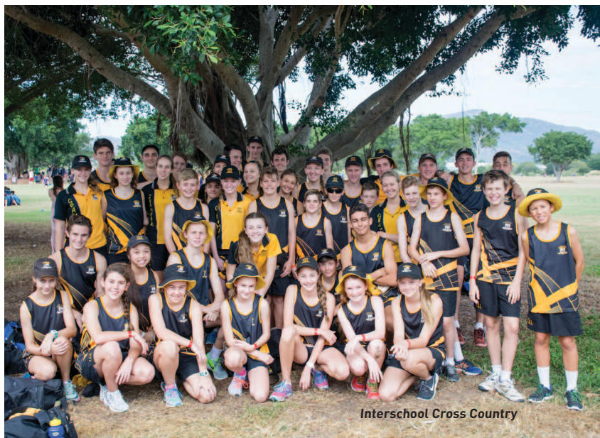
Interschool Cross Country