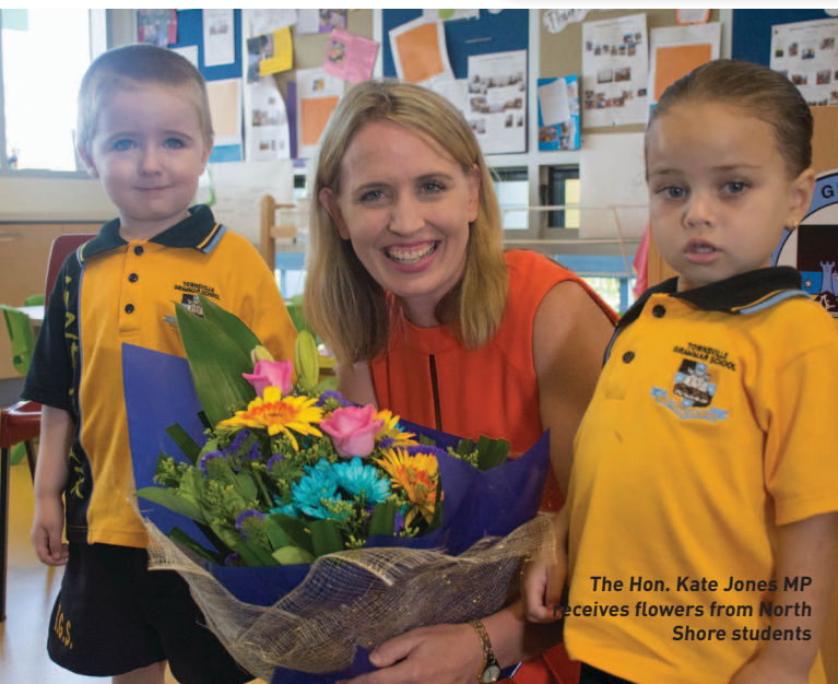
The Hon. Kate Jones MP receives flowers from North Shore students

MINISTER FOR EDUCATION OFFICIALLY OPENS THE EEC