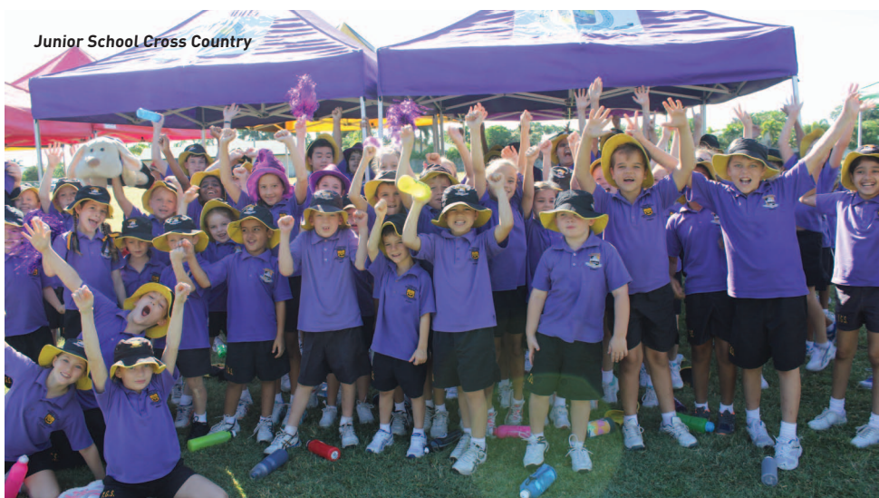
Junior School Cross Country