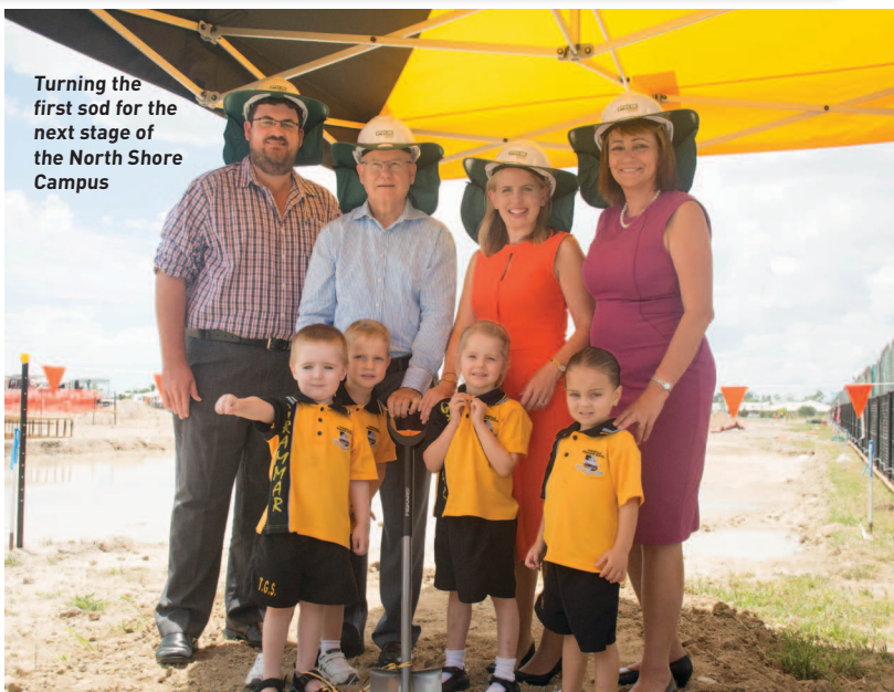
Turning the first sod for the next stage of the North Shore Campus