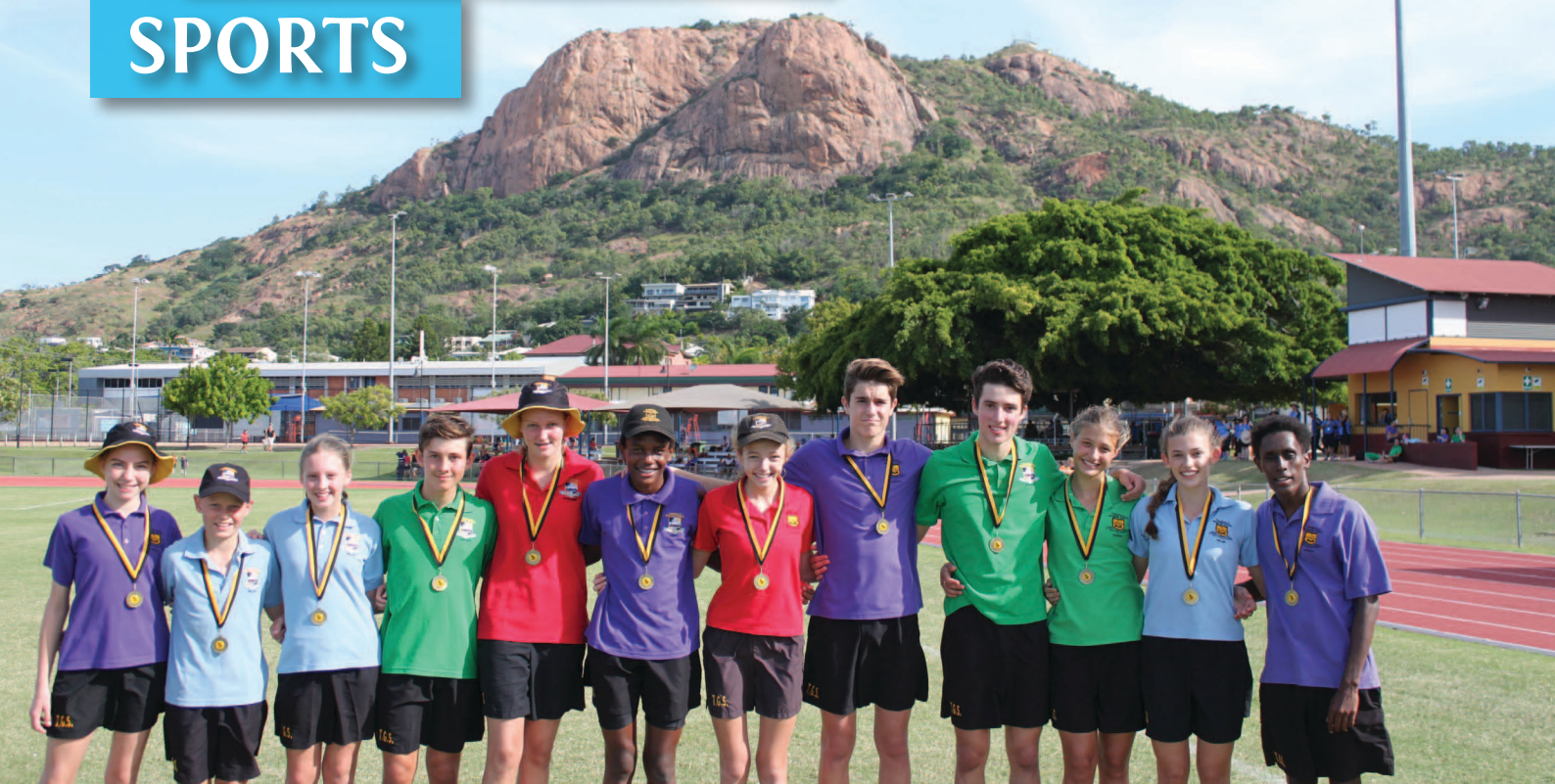
Infant Sports Day Olympics theme