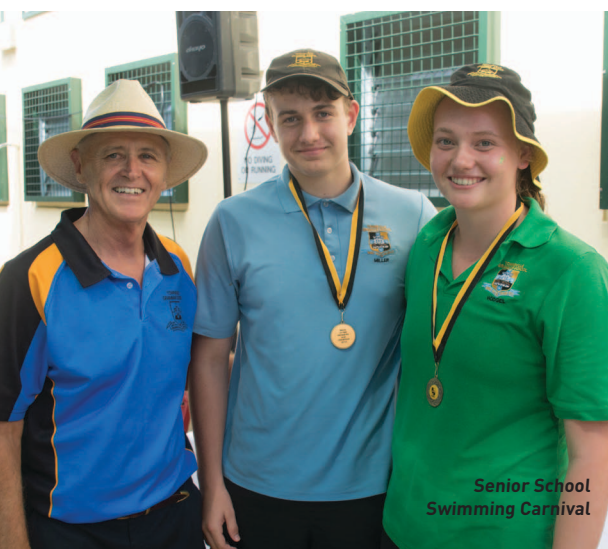
Senior School Swimming Carnival