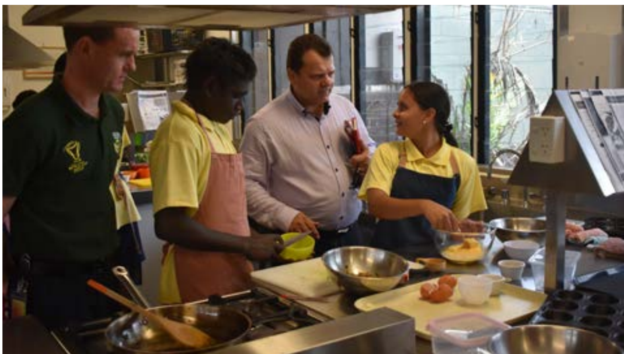
Food and Hospitality Class.