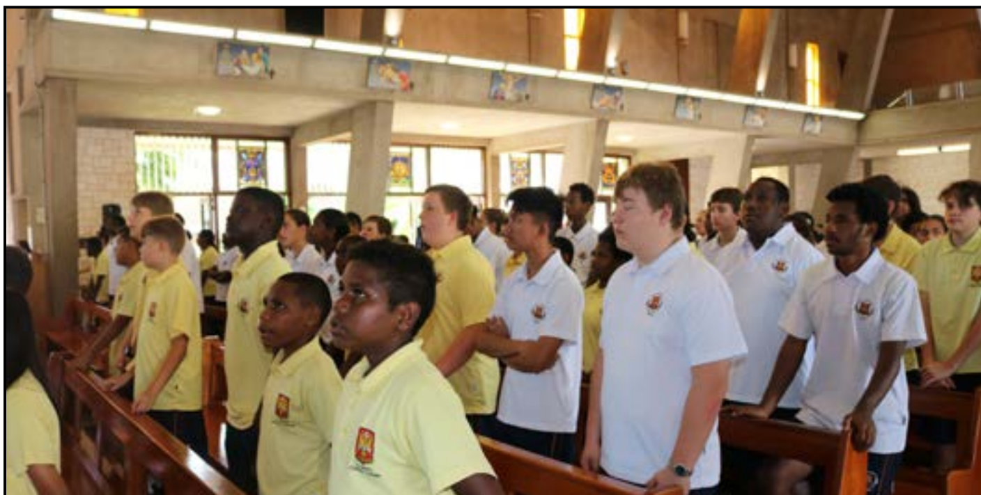
Whole School Opening College Mass