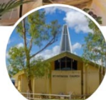
St Patrick's Parish Winton