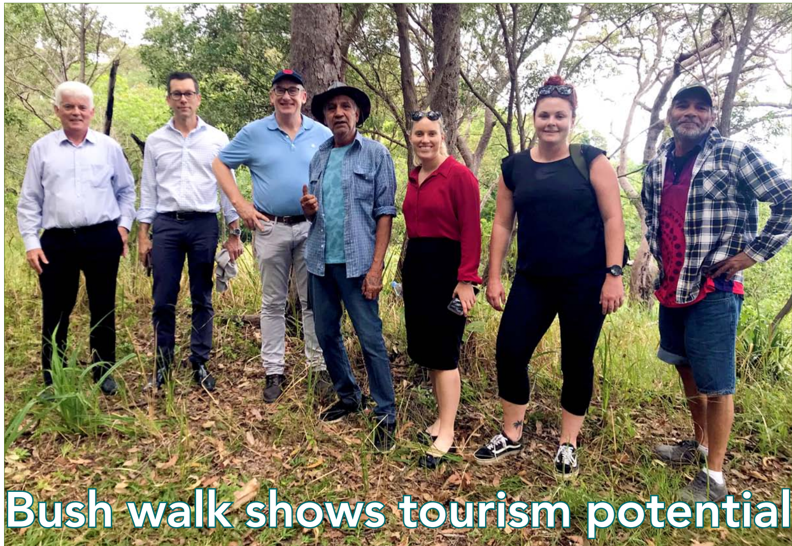
PICC Bush-walking Track volunteers and representatives from DSDMIP visit the bush-walking track earlier this month.

The potential for tourism on Palm Island has drawn the interest of the Queensland Government, who recently sent a group to visit some of our best natural and scenic sights early in August.