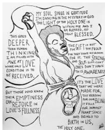
A modern Magnificat