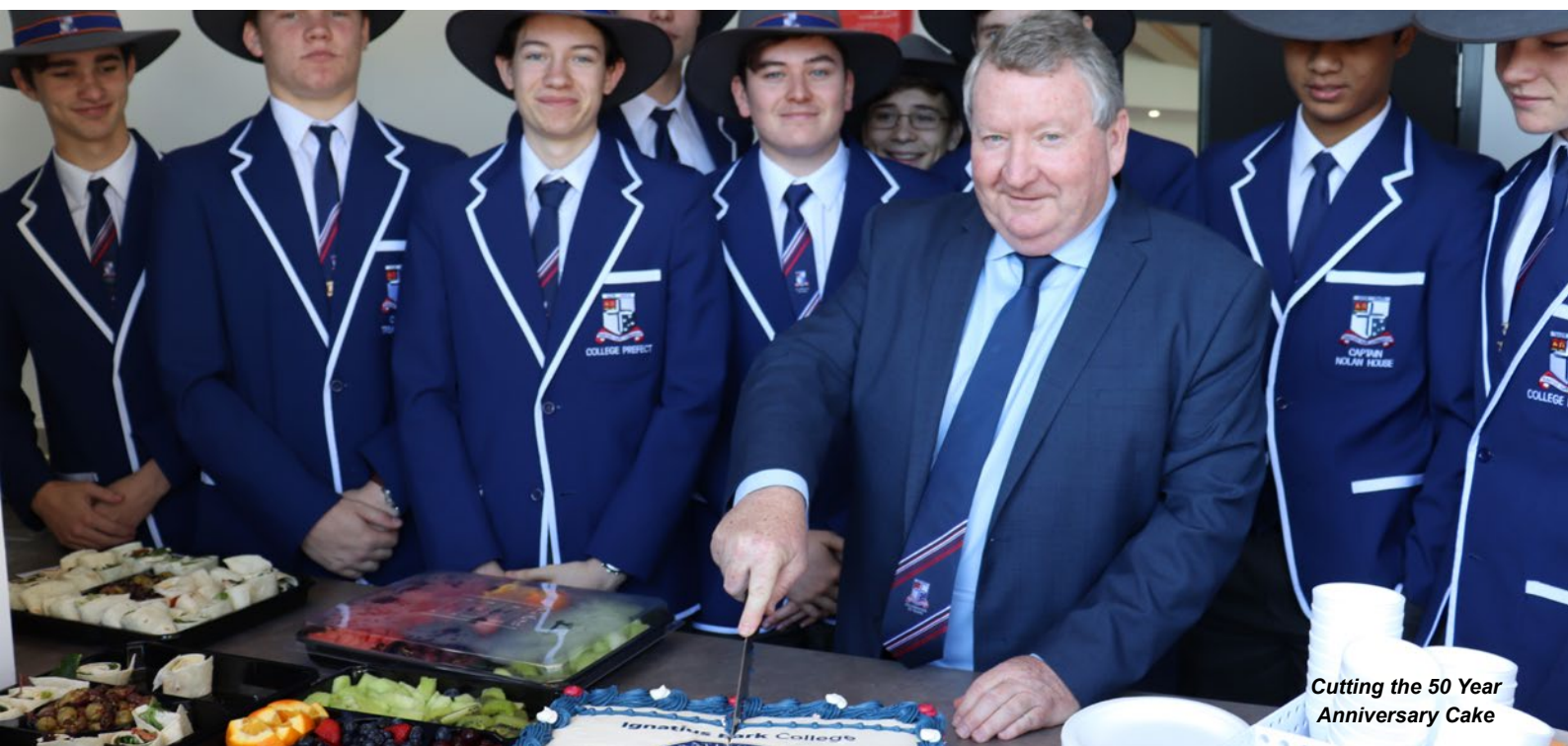
Cutting the 50 Year Anniversary Cake

384 Ross River Road, Cranbrook Townsville Australia 4814 E: info@ipc.qld.edu.au W: www.ipc.qld.edu.au T: 07 4796 0222 | F: 07 4796 0200