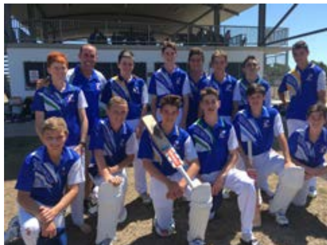
Team Photo T20 school champions of North Queensland 2018: Ignatius Park now face finals against the far north at Murray on 21 and 22 October