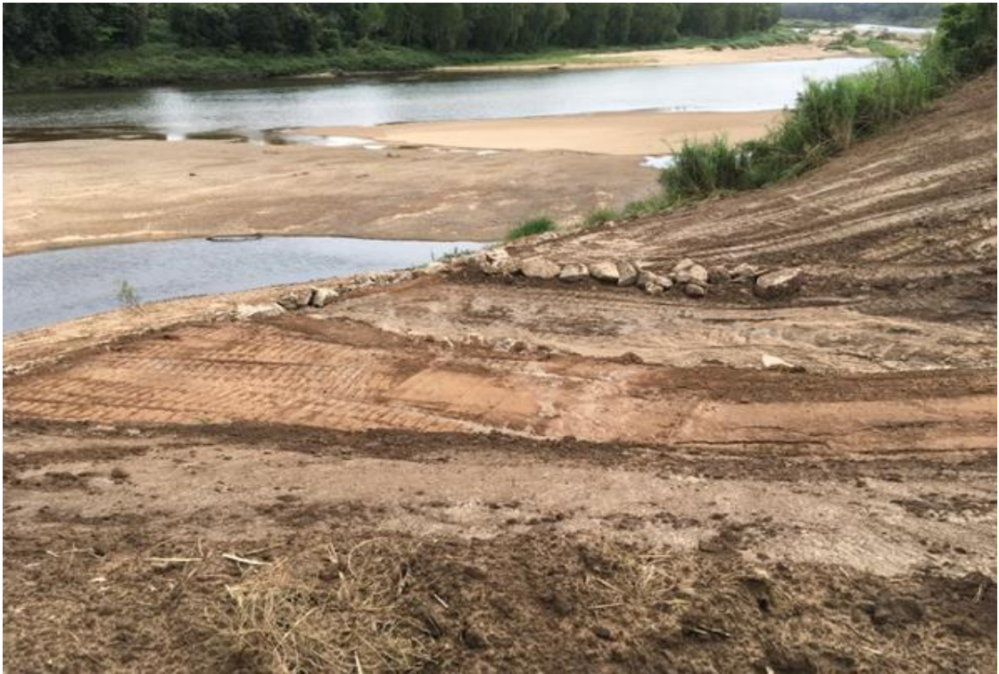
Lower bank reformed with clay fill and rocked for the outfall and stability under flood conditions.