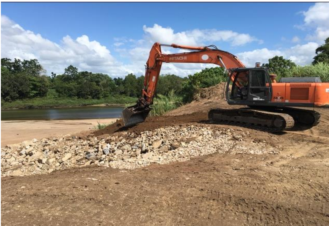
Bank battering and bank profiling completed. Outfall section rocked and top soil being placed.