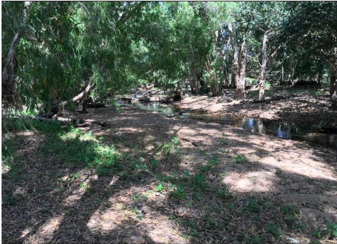
100m section where stream improvement requested. Debris and overhanging trees.

DRFA revegetation work SR-02 Stone River (Trovato site), WVC-02 (Zatta site), HR-02 Herbert River (Porta site) and Herbert North Bank sites.