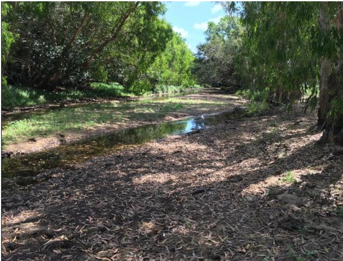
Cattle Creek successful improvement work up stream of site. Clearance work done 2018.