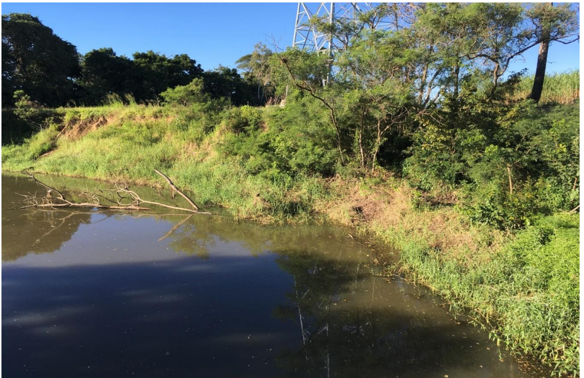
Powerlink - bank protection at tower - Palm Creek, adjacent to Cane Road.