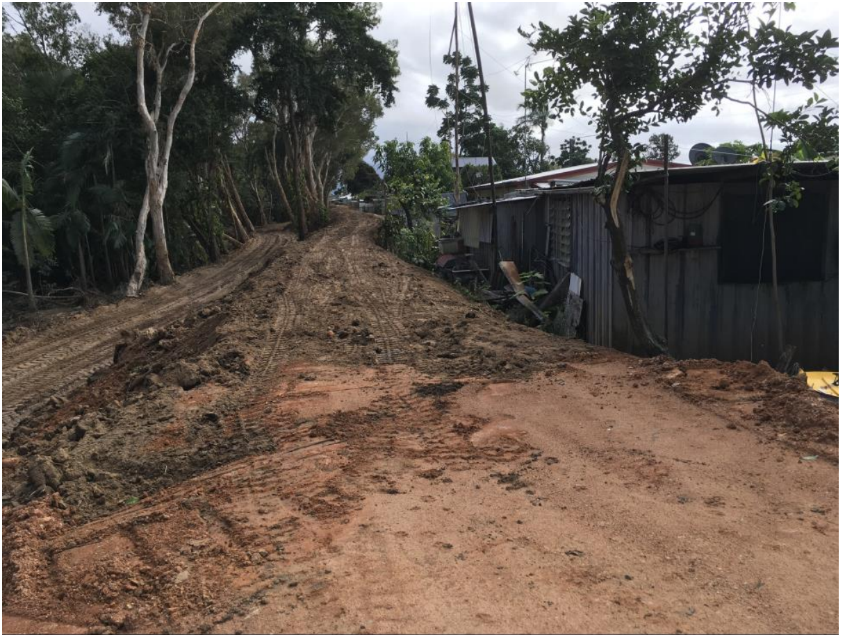
Work on the earthworks section behind the houses.