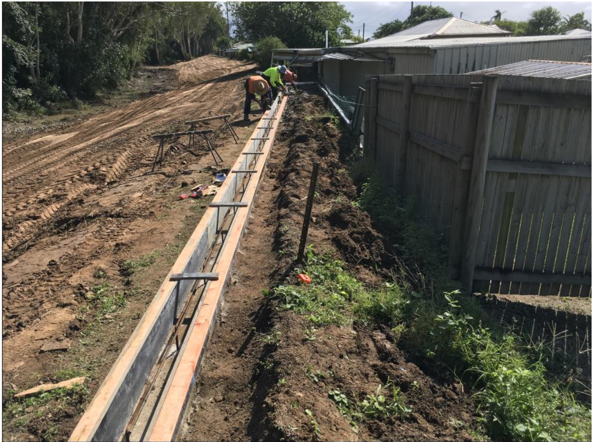
Work on the masonry block section behind the houses.

QRA has been on site twice since the work started to keep abreast of progress.