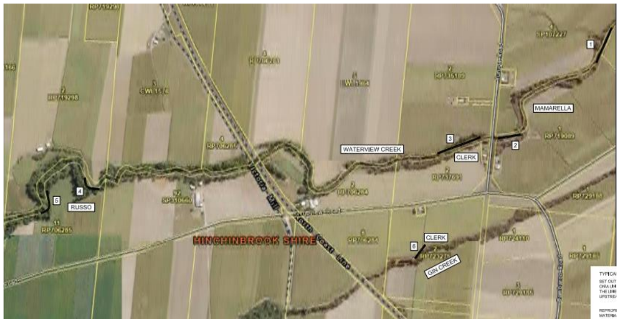
Waterview and Gin Creeks

sought from the allocated funding after a considerable amount of bank restoration was done by the landowner with QRIDA Category C funding in 2020.