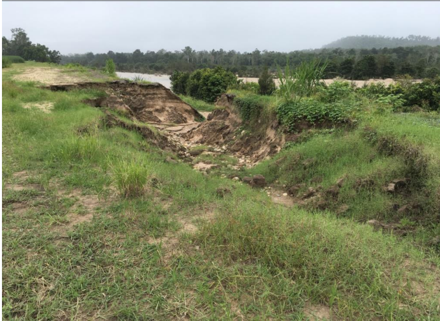
The washout in the upper bank working back into the paddock (after heavy rainfall in January/February 2021) - looking east.