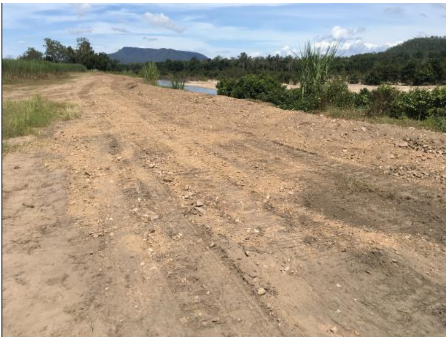
The washout up on the upper bank repaired - looking east.