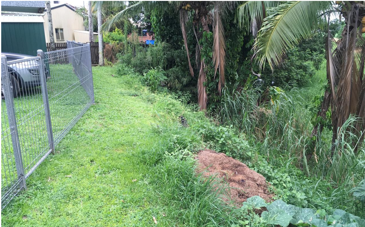
The slumped section behind the Agostinelli property.

Local drainage damage to upper bank batter and headland/paddock caused by local runoff running over the high bank at the upstream end of the site.