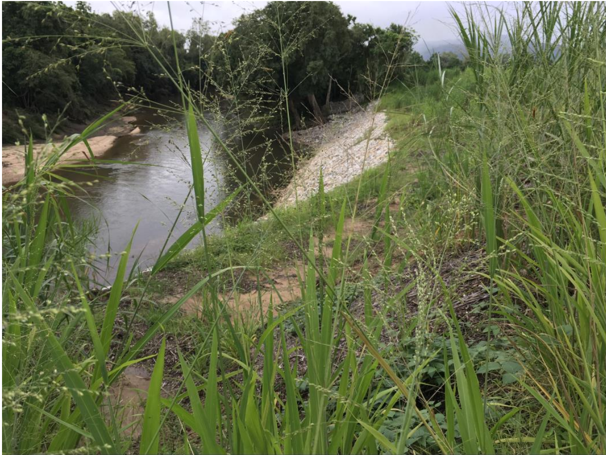
Stone River Trovato site looking downstream. Revegetation of upper batter area still to be done.

DRFA SR-2 Stone River (Trovato property) - no damage from January 2021 minor flood.