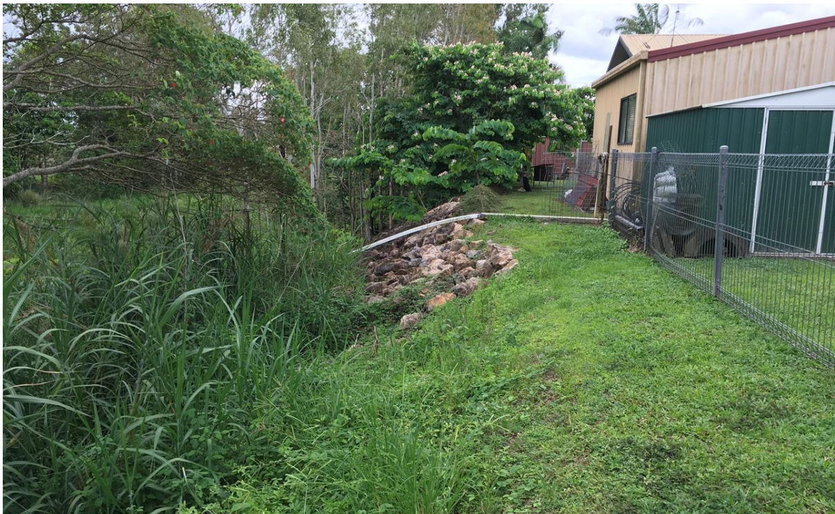
Existing rock stabilisation work that extends halfway across the Agostinelli property behind their shed and green house.

No contribution was requested from the properties in 2011. There is no talk of contribution from Agostinelli's this time.