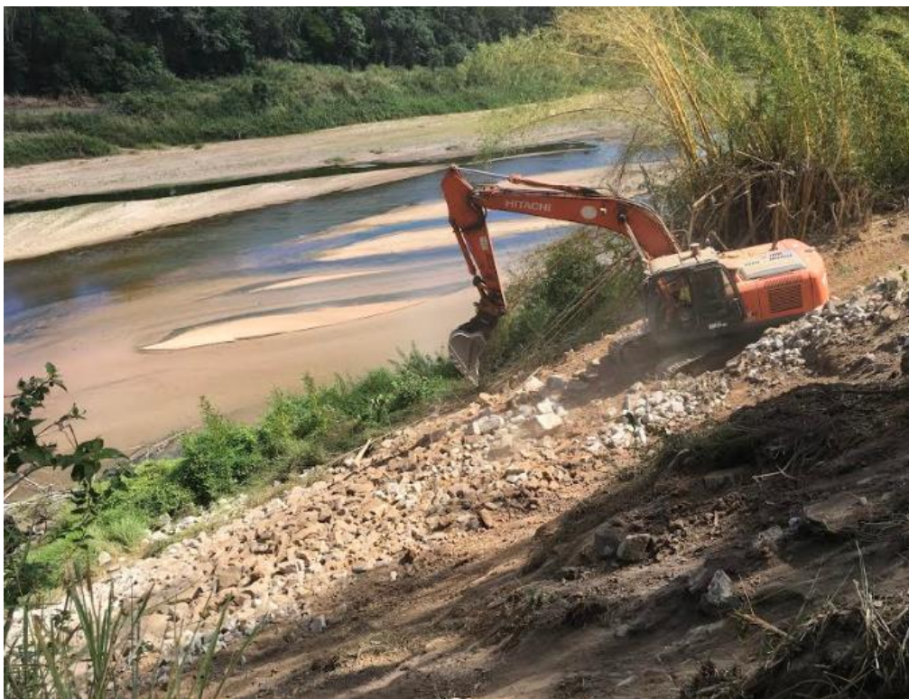
Working back up.