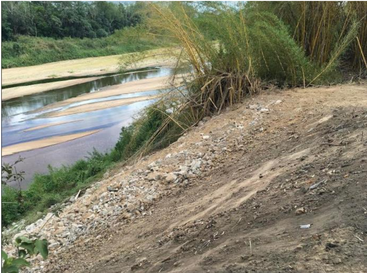
Bank re-profiling with 1,100t rock placed on the lower batter.

Cost: Invoices to come in now (figures exclude GST)