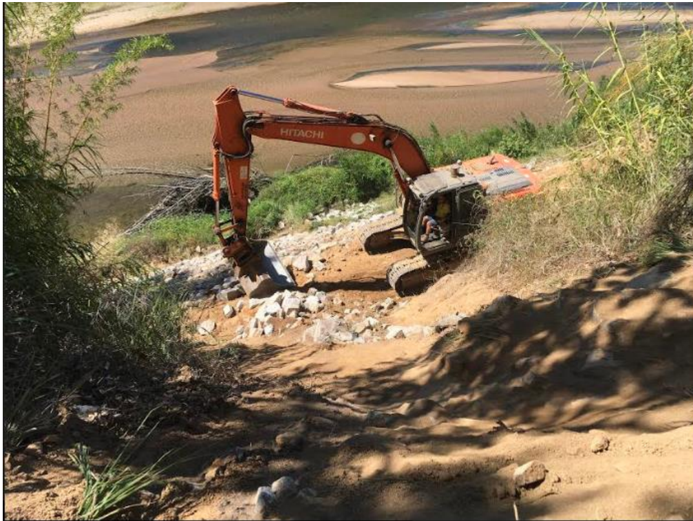
Getting the lower bank sorted out.