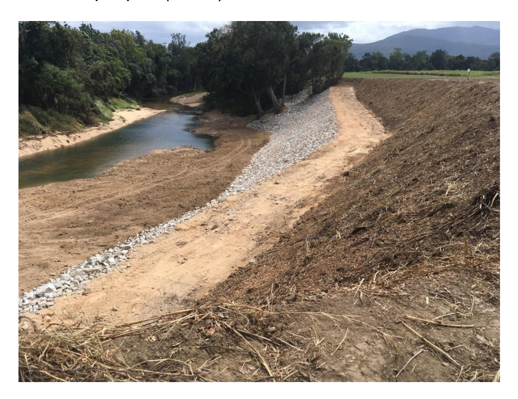
Waterview and Gap Creeks (WVC-2). Completed by contractor Zatta Holdings.

Stone River (SR-2) . Completed by contractor Keita Services.