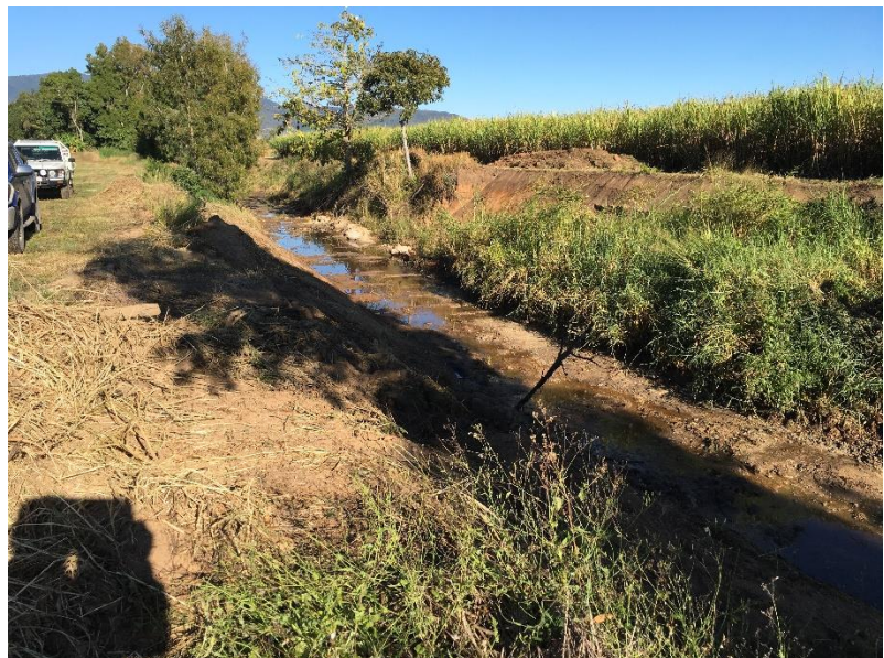
Gap Creek preparatory works – battering banks.