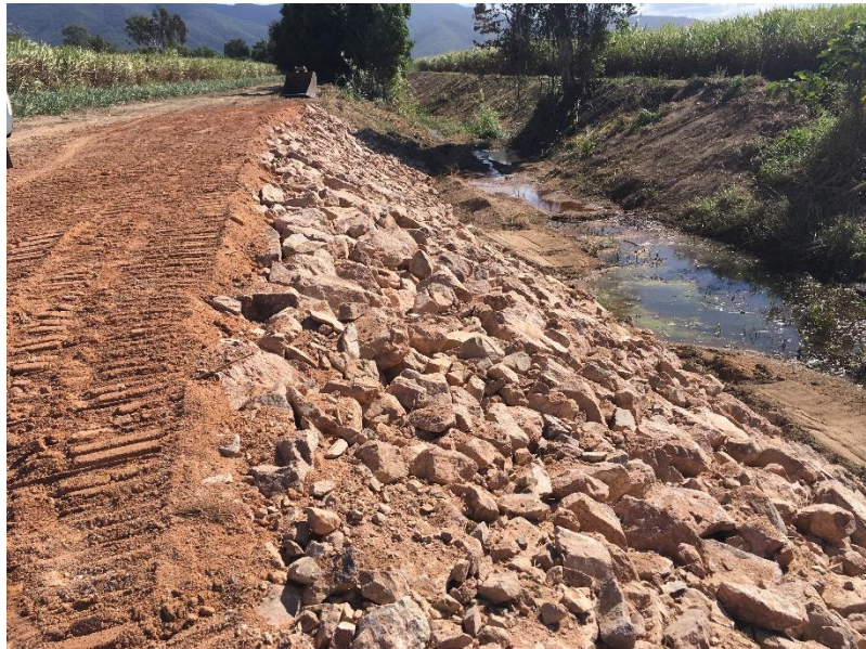
Re-profiled bank and rock stabilisation.