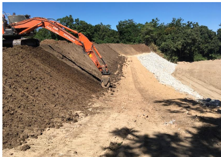
Place upper batter material and compact fill.