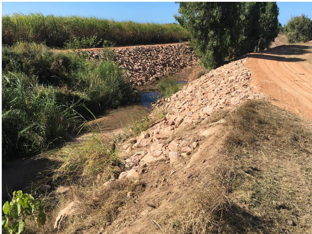
Re-profiled bank and rock stabilisation below Abswold Road invert crossing. Trees retained.