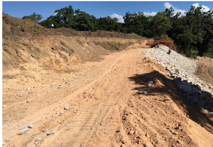
Construct bench and place rock.