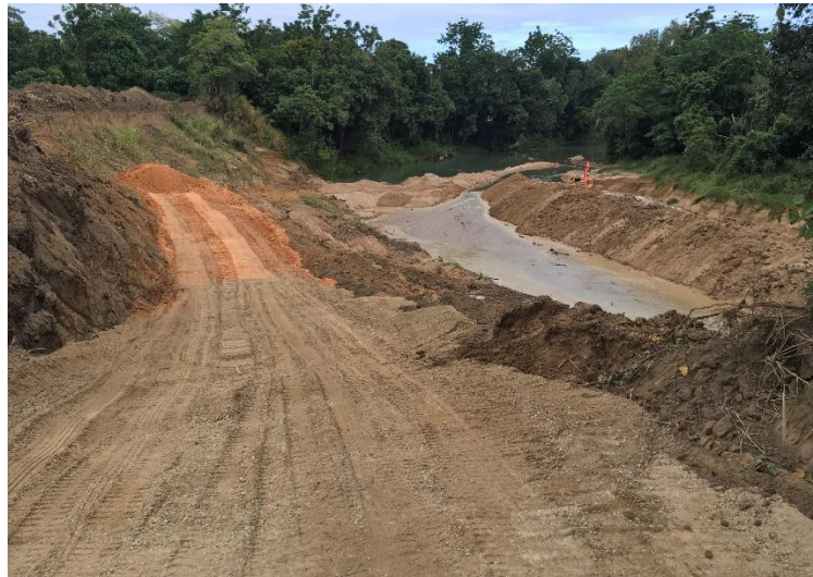
Moving the river channel over.