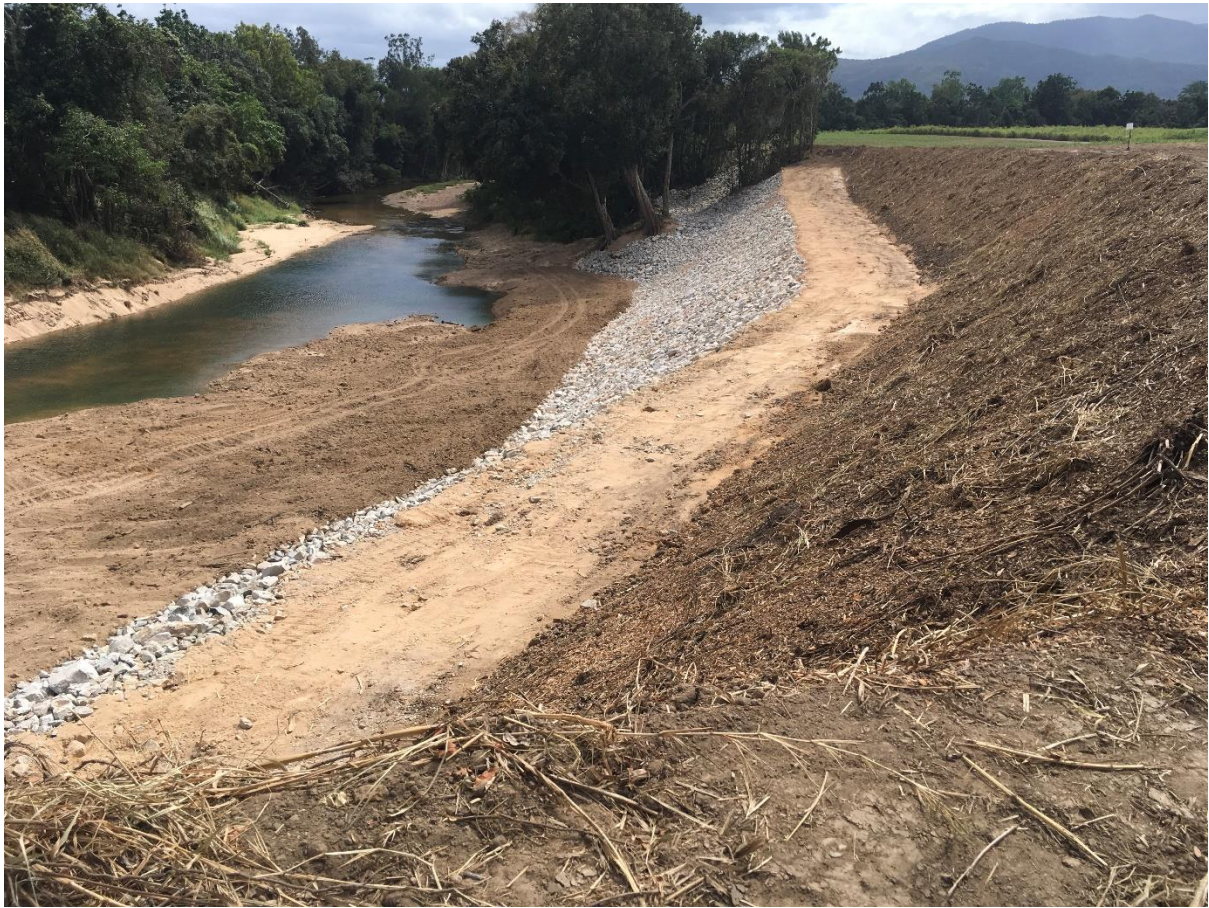
Stone River (SR-2) completed. Green mulch cover on upper batter slope.