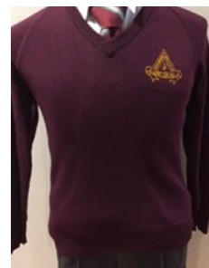
Optional Maroon Jumper