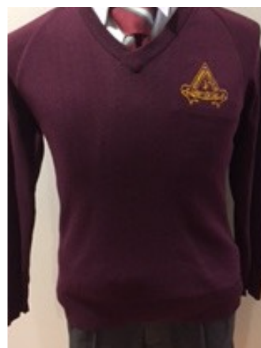
Optional Maroon Jumper