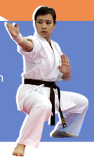
Shabnam Safa International Karate Champion

When: Wednesday 5 & Thursday 6 April 2017 Time: 9.30am - 11.30am for 6 - 12 year olds (register from 9.00am) 12.30pm - 2.30pm for 13 - 17 year olds (register from 12.00pm) Where: Mount Isa Basketball Stadium, Sports Parade