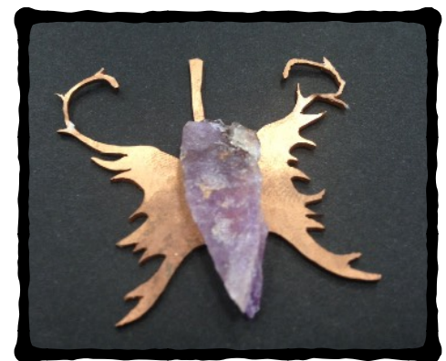
Erin McDonald (Year 12 Creative and Visual) - Uncut Crystal with Copper Setting (work in progress)