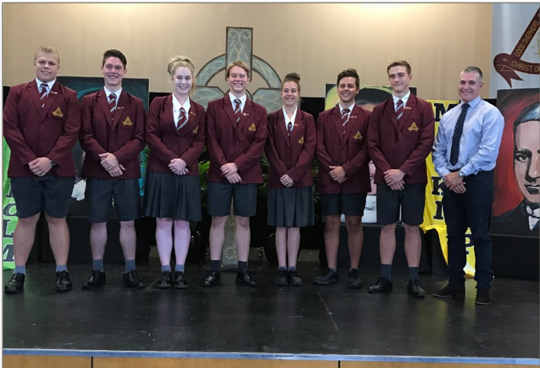
Senior Leaders with Mr Rob Katter MP at the Opening Mass

In order for students to consolidate this learning, they are required to visit Good Shepherd Parish (notes with more information about this excursion will be distributed later this week). Here they will be involved in a number of sessions where information will be presented regarding the extent to which Good Shepherd Parish demonstrates the different models of a church. This information is critical for the successful completion of their assessment this term. The final copy of this assessment will be due in Week 9.