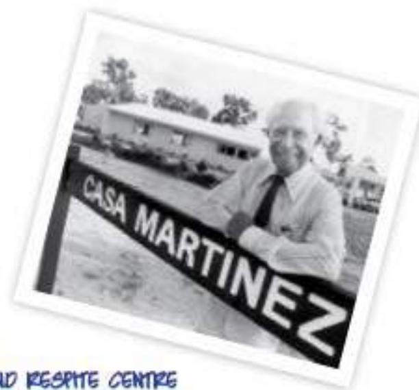
OLD CASA MARTINEZ NOW OUR ACTIVITY AND RESPITE CENTRE