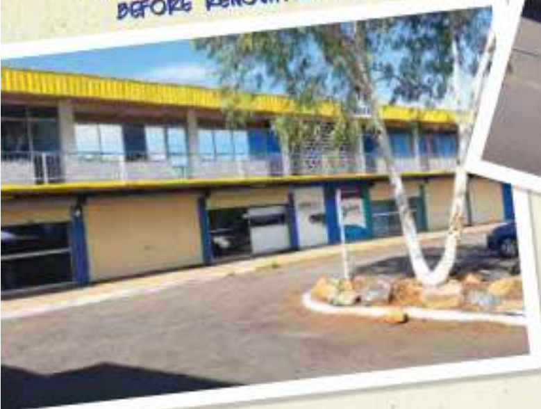
OUR NEW BUILDING IN MT ISA BEFORE RENOVATIONS