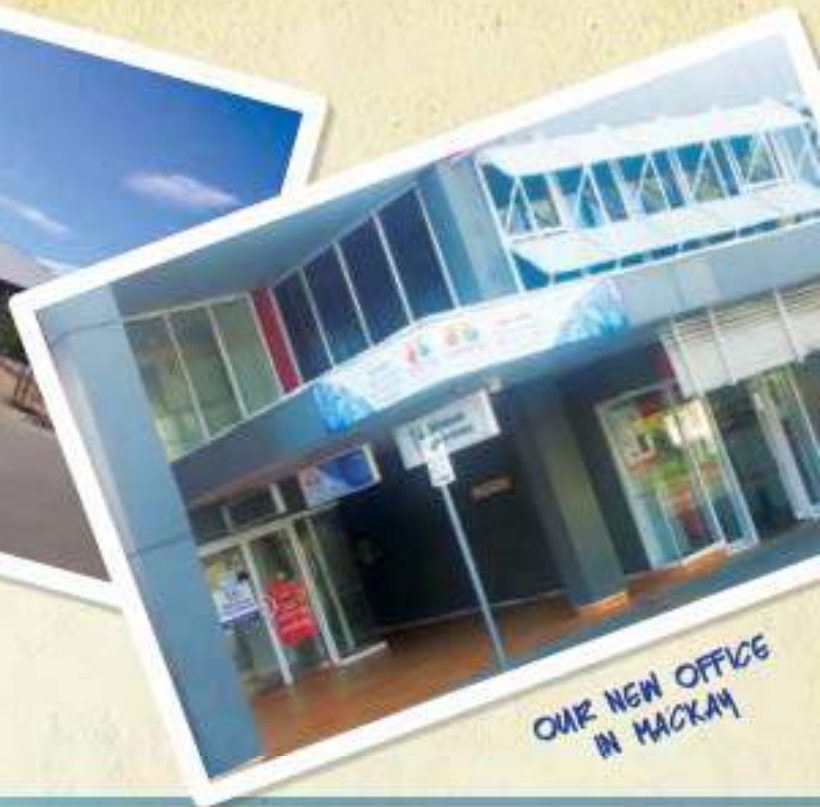
OUR NEW OFFICE IN MACKAY