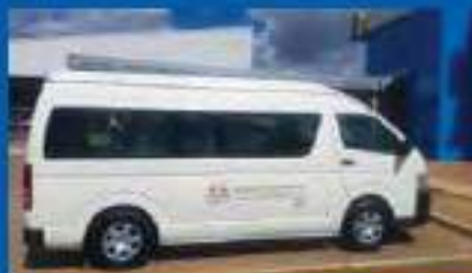
OUR NEW BUS, KINDLY DONATED BY THE TOWNVILLE SOUTH WEST ROTARY